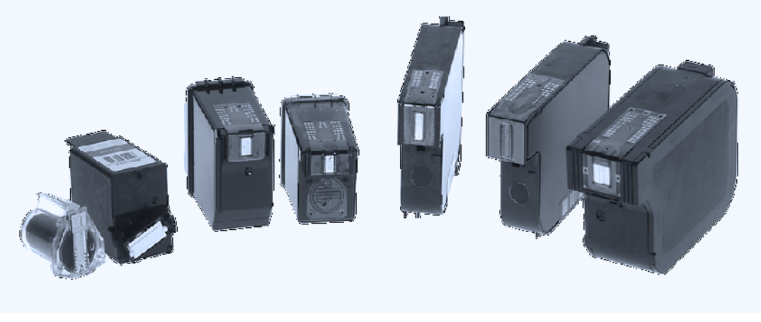
Figure 1. Hewlett Packard Thermal Inkjet Family Potrait

The TIJ Famity Portrait (Figure 1) shows the evolution of appearance from the 1984 to 1995. Our first products were aimed directly at the 9 wire market and were 12 nozzle systems( at 92 dpi). The next products at 180 dpi aimed at the graphics market (Paintjet). The big advancement was 300 dpi "laser-like" printing of the early Deskjet product line. From Paintjet through the Deskjet 600 Series, all pens were passively driven and the nozzle plates, gold plated electroformed nickel. This series is designated TIJ2. TIJ2.5 arrived with the narrower pen body and integrated drive electronics of the 1200C products. Swath width increased to 1/3" and the throughput increased to 6 ppm for black . The step to 600 dpi, 1/2" swath and nozzles in the flexcircuit marked the beginning of TIJ 3 design. Several factors were involved in the push to TIJ 3. The strongest factors being: materials design freedom for the ink chemists, residual stress reduction during assembly and increased through-put with quality. The features of each print head are shown in Table 1.